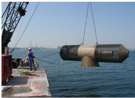
WE Power - (24) T-96HCE (2.2 BGD)

Note - If the wire size is reduced to accommodate the coating thickness and maintain the needed open area - then the issue is the actual strength of the screen itself. Note - The above is all assuming the coating is applied in an exact even way, which is not what it would be. Blinding across the tight slot widths would also be a concern.