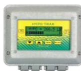
HYPO TRAK For sodium hypo- chlorite. Bulletin 516

The Electronic Chem-Scale can be ordered with the Wizard 4000, SOLO G2 or HYPO TRAK Digital Weight Indicator for a complete monitoring system.