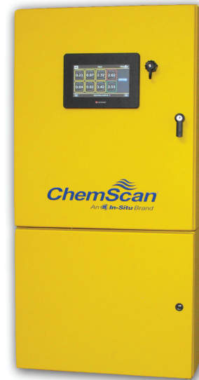
New Model with Graphic Interface

ChemScan on-line analyzers provide operators and control systems with timely process chemistry measurements. These data are used to control and optimize the process resulting in increased plant capability, reduced energy and chemical usage along with monitoring the process for compliance.